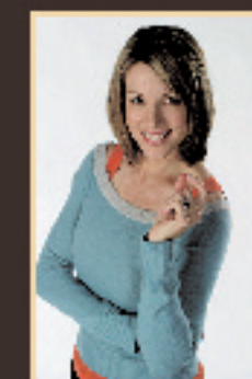
Santa Barbara-based Host of TLC's hit TV show Property Ladder