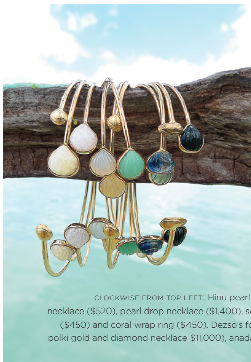
CLOCKWISE FROM TOP LEFT: Hinu pearl drop earrings, ($1,600), Tavarua clam shell necklace ($520), pearl drop necklace ($1,400), seashell rings ($275 each), Sunrise shell ring ($450) and coral wrap ring ($450). Dezso's fossilized shell with polki diamond ($2,500), polki gold and diamond necklace $11,000), anadara carved stone gold bangles ($615 each).